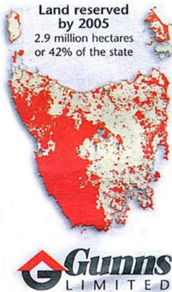
Land reserved by 2005 2.9 million hectares or 42% of the state